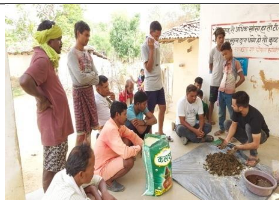
Training on Organic farmers