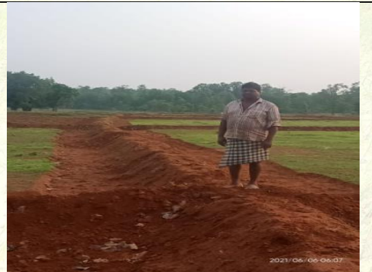
MGNREGA work under ITDA Bonai