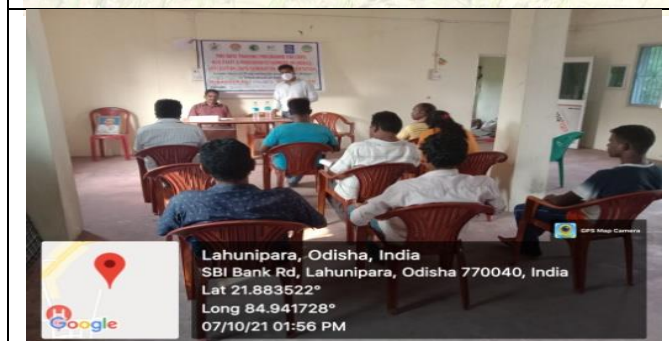
Progresive farmers training