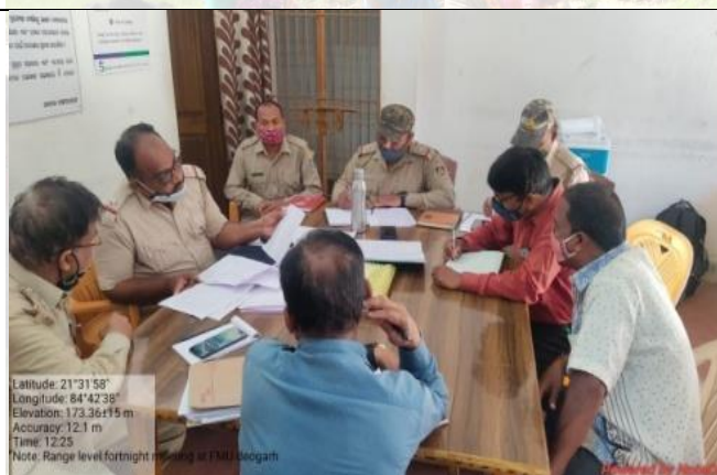
AJY review at FMU level