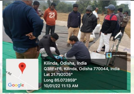
Ragi seed Testing