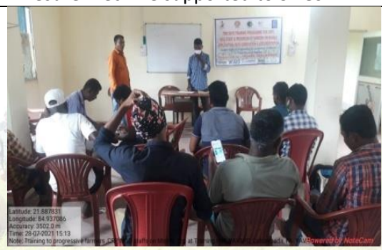
Training on Mobile application to CRP&Progressive Farmers