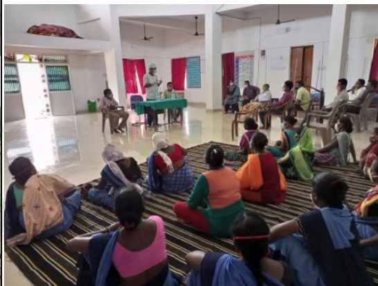
MOIC counselling to MWH staffs ,ASHAs and Community members