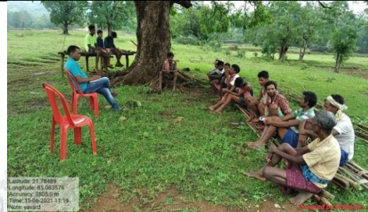
Community mobilisation for millet cultivation