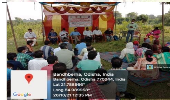
Field day program on Millet(Ragi) at poigoan