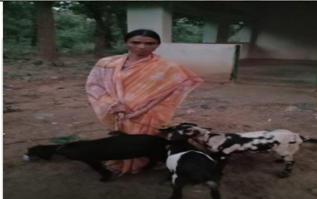
Goatary support to WSHGs by ITDA Tileibani