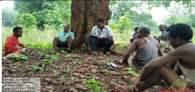
Group meeting & Beneficiaries selection for Millet cultivation