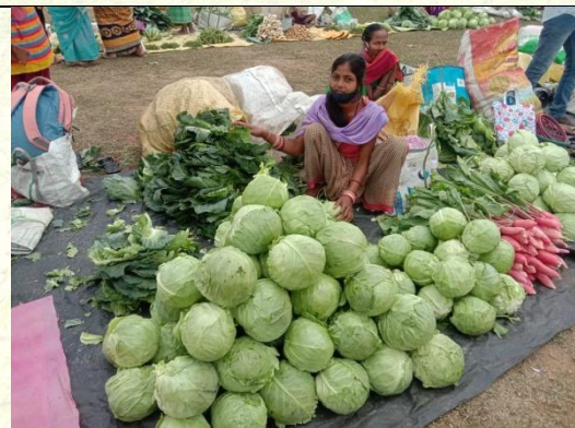
Selling at open market