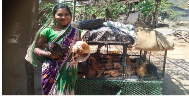
Poultry supported to SHG members by ITDA Tileibani