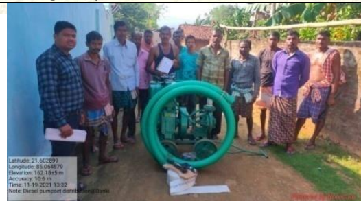
Waterpump supported to farmers by ITDA Bonai