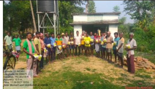
Seed supported to farmers