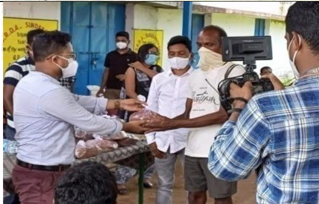
Millet seed distribution by Subcollector, Bonai