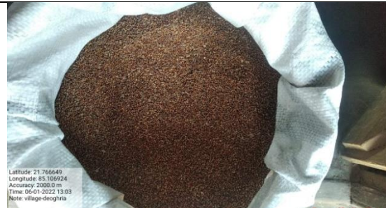
Ragi seed production