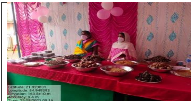
Millet Food festival