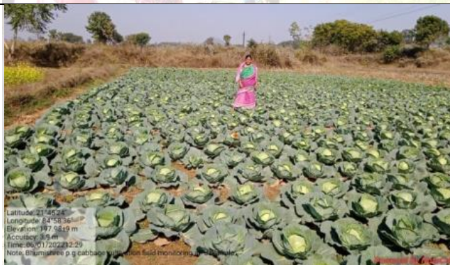
Cabbage cultivation supported by ITDA Bonai