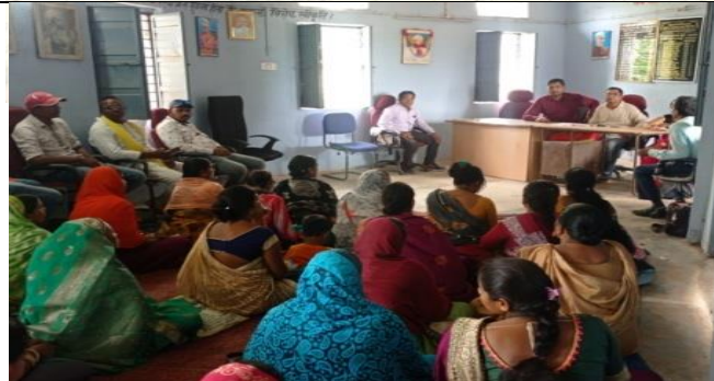
Meeting with Women Group leader