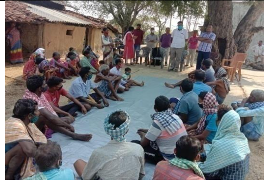
PA ITDA Bonai&JE community mobilisation on MGNREGA