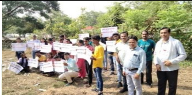
Small Forest promotion Exposure for Youth