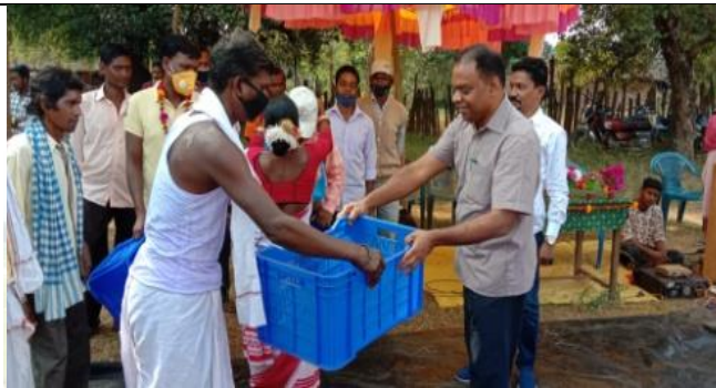
PA ITDA Bonai distribution try to farmers at kundeidiha