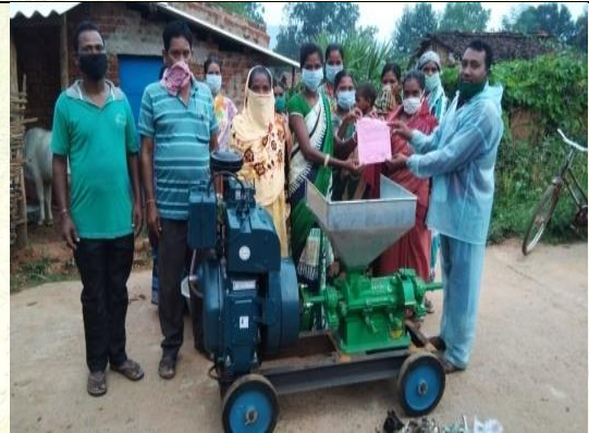
Rice hall support to SHGs by ITDA Tileibani