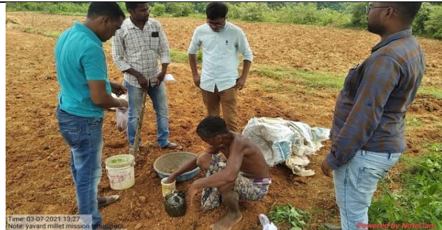
Millet Seed treatment at Poigoan