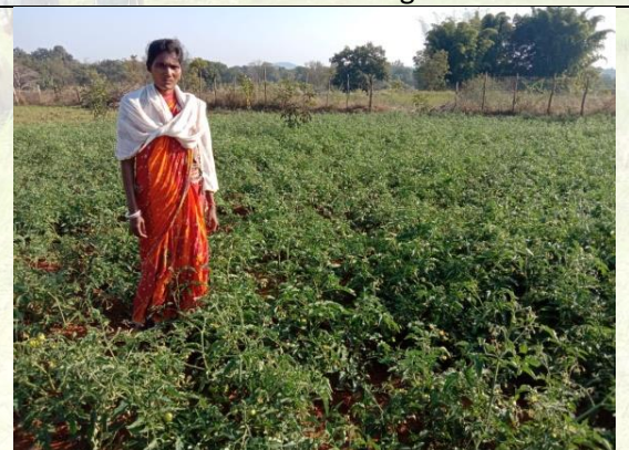
Tomato cultivation supported by ITDA, Bonai