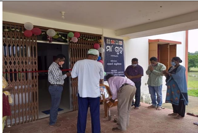
Opening of MWH at Chordhara