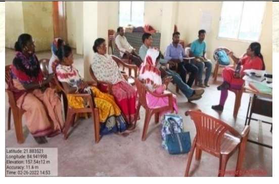
Training on seed managemnt