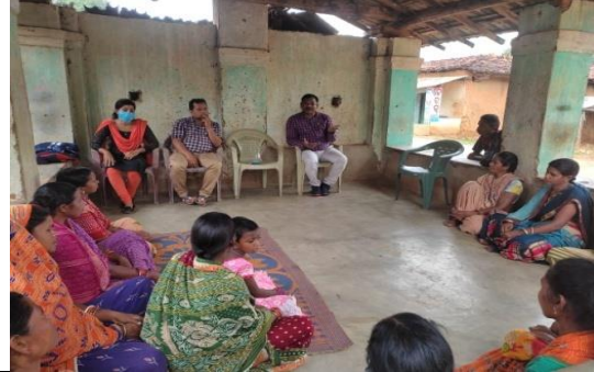
Discussion with WSHG by PA ITDA Tileibani and PM