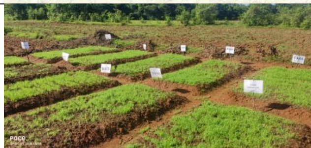
Millet(Ragi) nursery bed