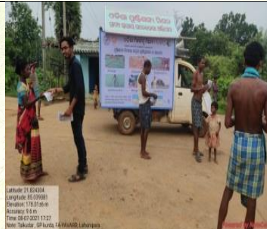
Village level Ratha Awareness programm on millet