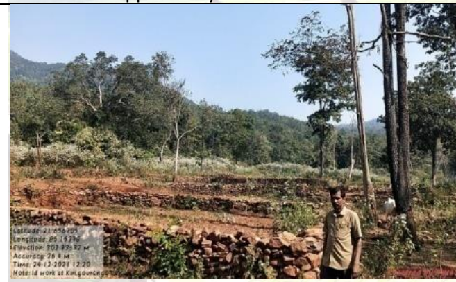
Land bonding (FRA Land, Kiri) under MGNREGA