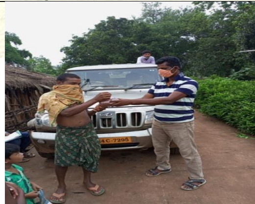
Seed distribution to farmers at village level