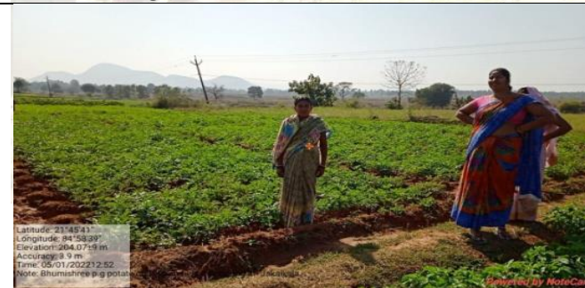
Potato cultivation Supported by ITDA Bonai