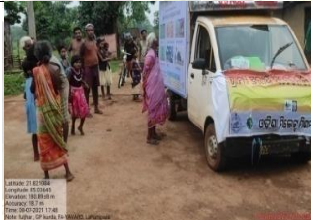
Village level Ratha Awareness programm on millet