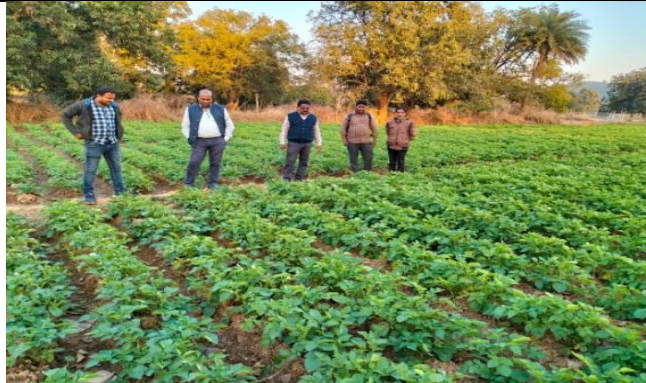
Horticulture department visiting potato cultivation area