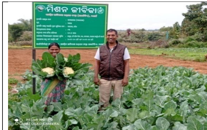
Cauliflower supported by ITDA Bonai