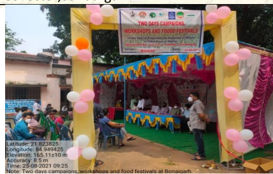
Food festival encourage by collector