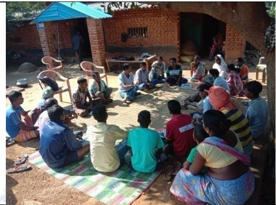
Farmers mobilisation meeting at kundeidiha