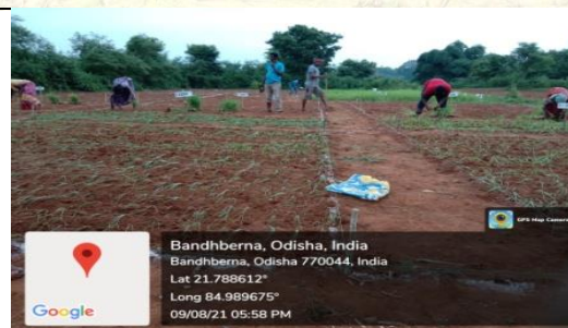
SMI planting of Rgi