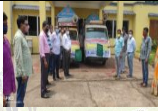
Ratha awareness program on millet ennagurated by DDA,Sundargarh