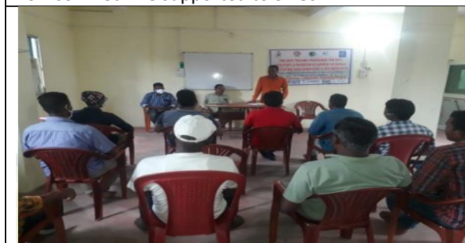
Progressive farmers training