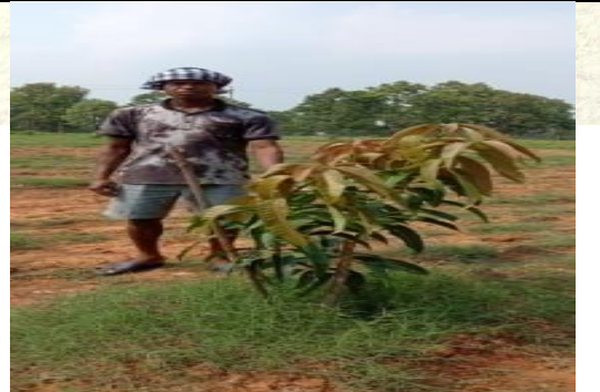
Mangoplantation under ITDA WADI programme at kundeidiha