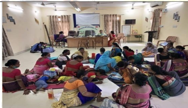
MAS training at Rourkela