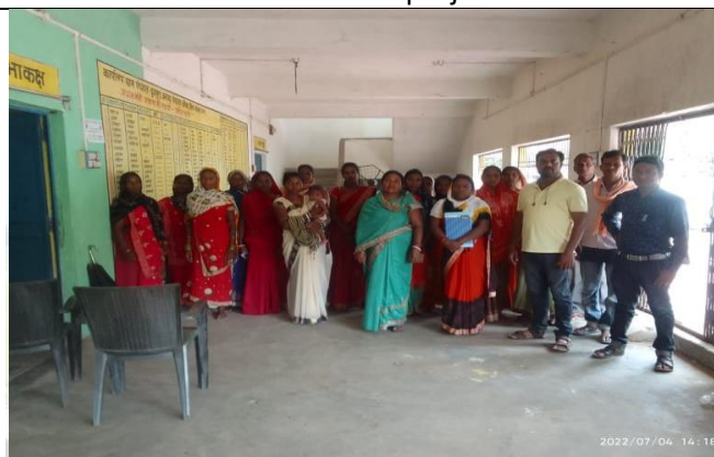
Meeting with WSHGs