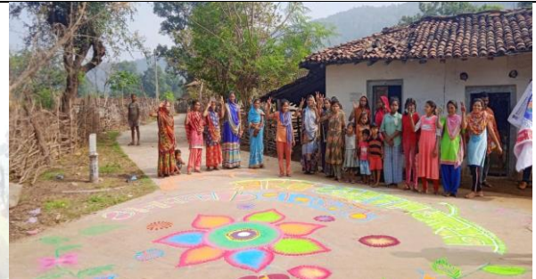
Celebration of National Girl Child Day