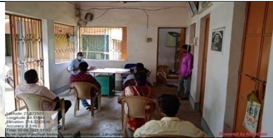
Orientation meeting on MGNREGA at purnapani GP