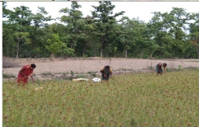
Harvesting of Ragi