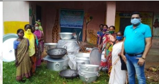
Tent material to WSHG supported by ITDA tileibani