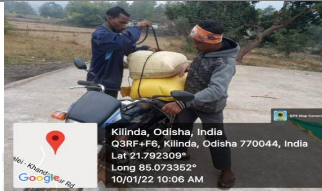
Farmers taking Ragi seed for sell to mandi