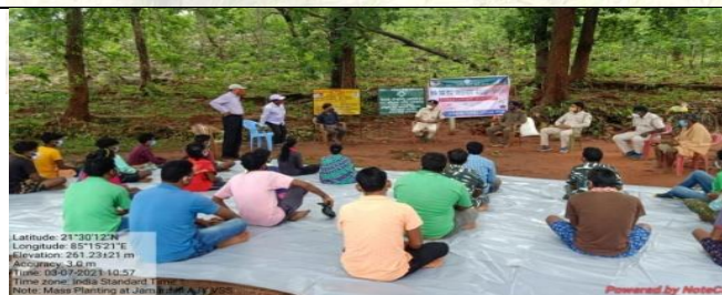
Vss meeting at village level