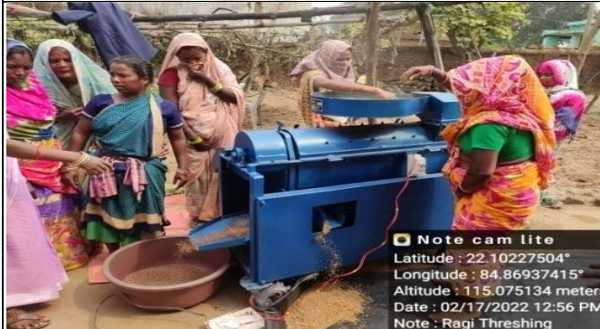
Ragi thresure mechine supported to SHG members