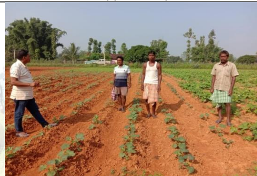
YAVARD chief functionary discussion with farmers at kundheidiha