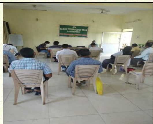
FMU level meeting