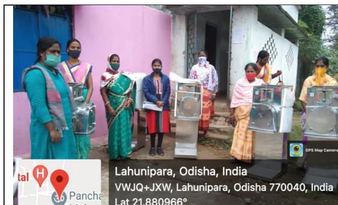
Polvisor machine supported to SHGs