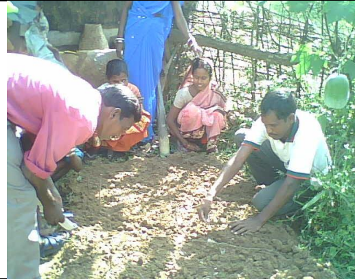
Kitchen gardening training