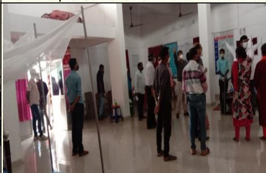
Collector visiting MWH ,chordhara