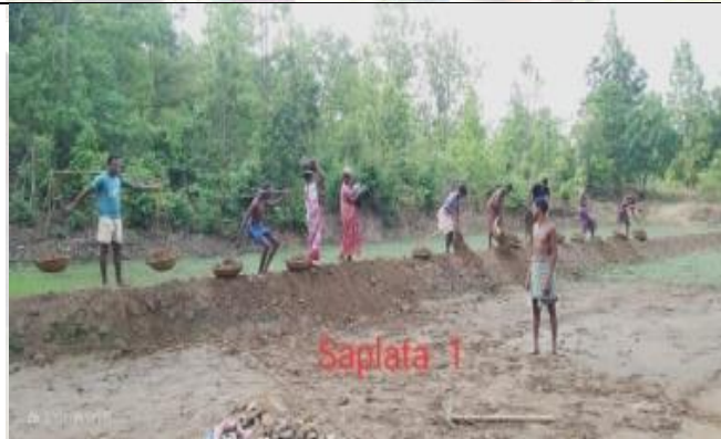
MGNREGA work under ITDA Bonai