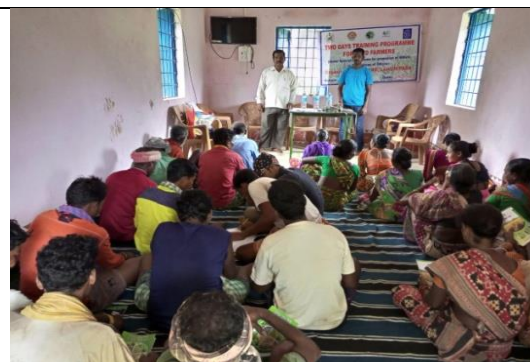
Training to Farmers