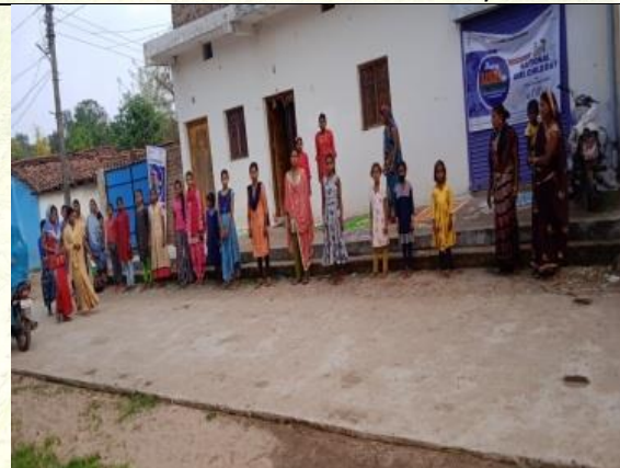
Rangoli competition on National Girl Child Day