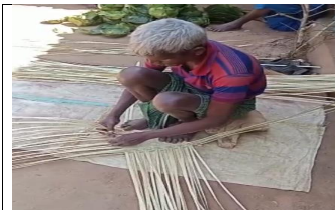
Bamboo Artisan under SFURTI project