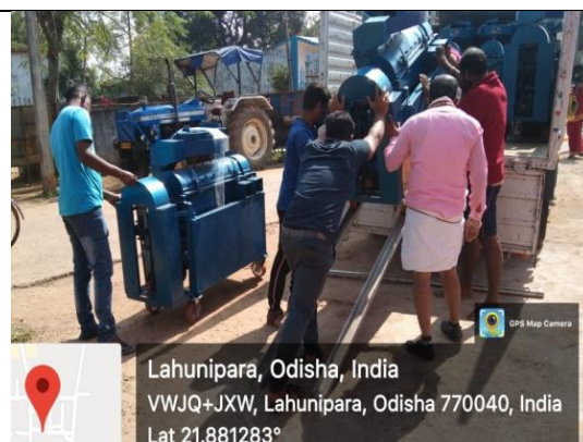
Thresure machine supported to SHGs