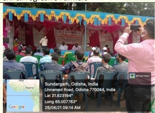
Food festival ennagurated by Collector,Sundargarh