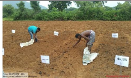
Nursary bed preparation for PVT Field