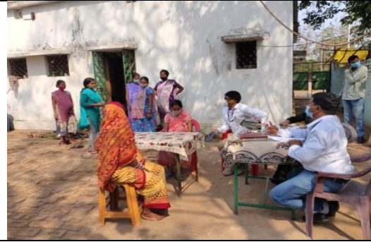
Annually evaluation of MWH by DPM,PP Coordinator