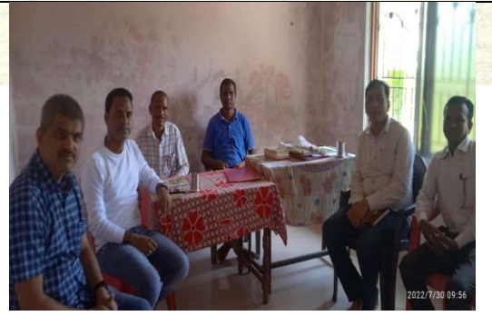
Meeting with SFRUTI Staff and Govt.Staff