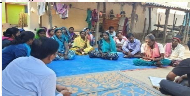
Community mobilisation meeting