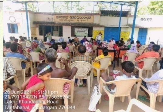
GP level meeting on millet awareness meeting at Talbahali by sub collector, Bonai & OMM sundargarh