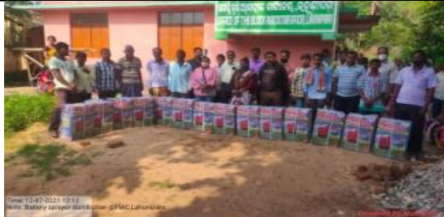
Spreyer machine supported by ITDA Bonai