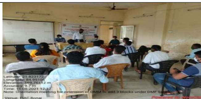
Progressive farmers and CRP training