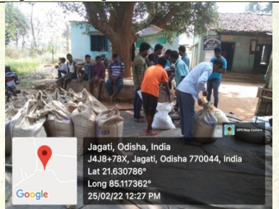
Ragi mandi at Mahulpada