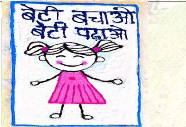
Rangoli to Celebrate National Girl Child Day