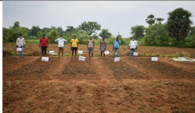
PVT field nursery