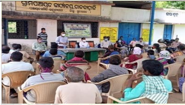
GP level meeting on millet awareness meeting at Talbahali headed by sub collector, Bonai & OMM sundargar