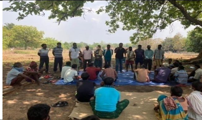
Community mobilisation meetings