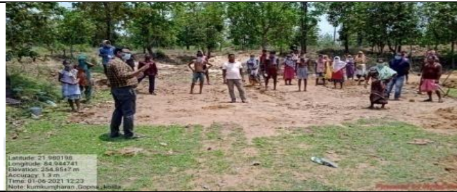
MGNREGA work under ITDA Bonai