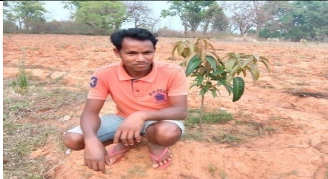
Mangoplantation under ITDA WADI programme at kundeidiha