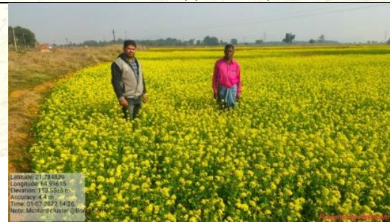
Mustard cultivation supported by ITDA, Bonai