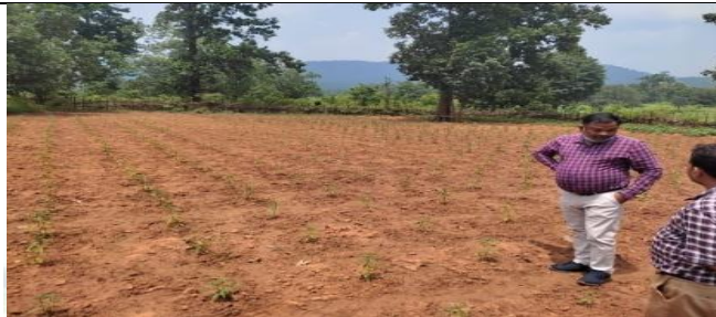
Field visit b PA ITDA Tileibani and Programm Manager