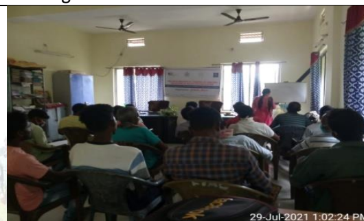
Review meeting at Bonai on Millet project