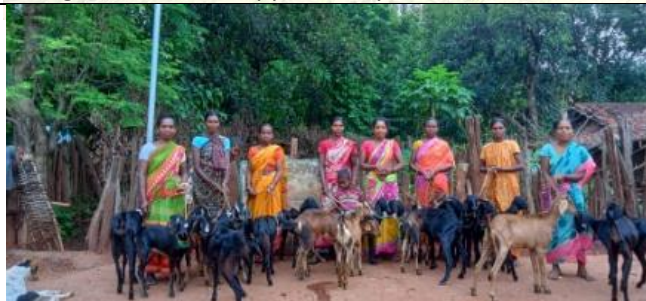
Goat supported to WSHG members supported by ITDA Bonai