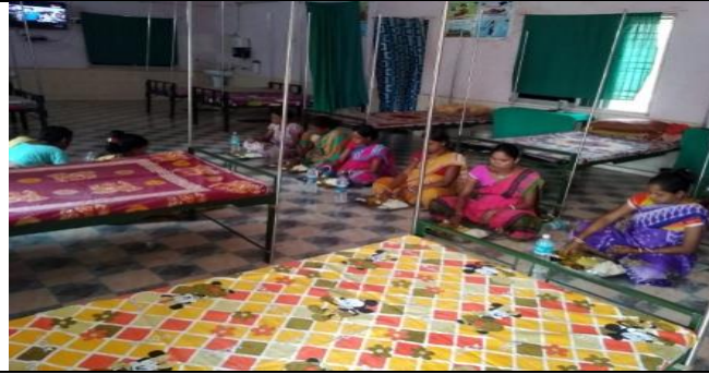
Nutritious food at MWH