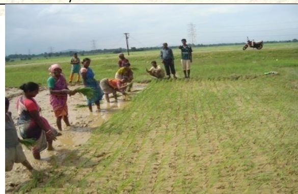
SRI transplanting paddy